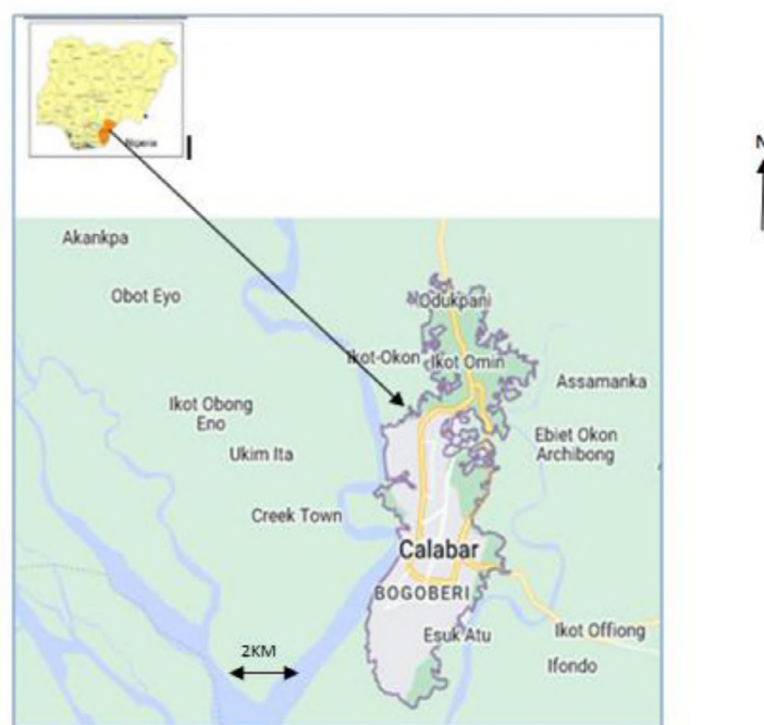
Figure 1. Map of the Study area, Calabar, metropolis: insert is map of Nigeria showing Calabar (adapted and modified from map data 2023).

The area is built on the Niger Delta basin Tertiary and Quaternary sediments ( Short & Stauble, 1967 ) that consist of alternating sequences of gravel, sand, silt, clay, and alluvium. These sediments are primarily derived from the adjoining Precambrian basement (Oban Massif) complex and Cretaceous (Calabar Flank) rocks ( Ekwere et al. , 2021; Ekwere & Elueze, 2012 ). The basement complex is made up of gneisses, granites, schists, pegmatites, and a host of ultra-mafic suites ( Ekwere et al. , 2012 ) while the Cretaceous sedimentary unit is built up of limestone, sandstones, shales, and marls ( Reijers, 1996 ). The soils and sediments on which the study area is domiciled represent a link between the fresh bedrock, the weathered profiles, and the soils that envelope the landscape of the lower Niger Delta basin. The soils are of the ultisol class characteristic of old landscape settings, i.e., lateritic ( Ekwere et al. , 2021 ).