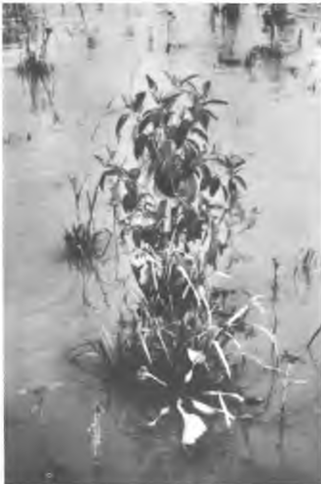
Sphenoclea zeylanica in a deeply flooded area of Isla de Ronda, Río Amazonas, Comisaría del Amazonas, Colombia.