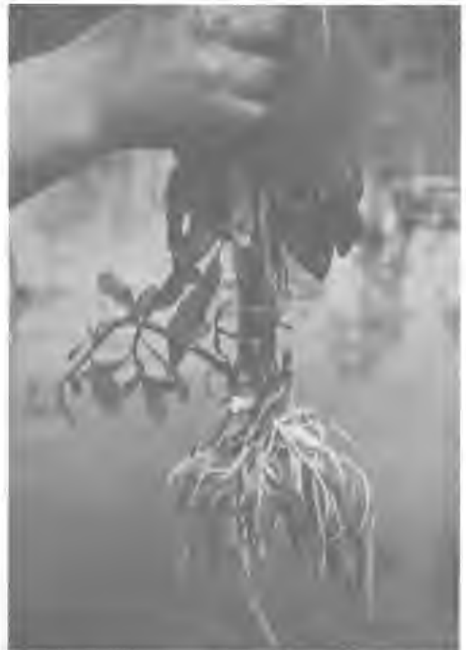
Sphenoclea zeylanica , showing the complex root system of the plant, Isla de Ronda, Río Amazonas, Comisaría del Amazonas, Colombia.

In view of this discrepancy —the use of the plant as food in Southeast Asia and its toxicity in the Amazon region— we undertook to determine whether or not extracts of Sphenoclea zeylanica