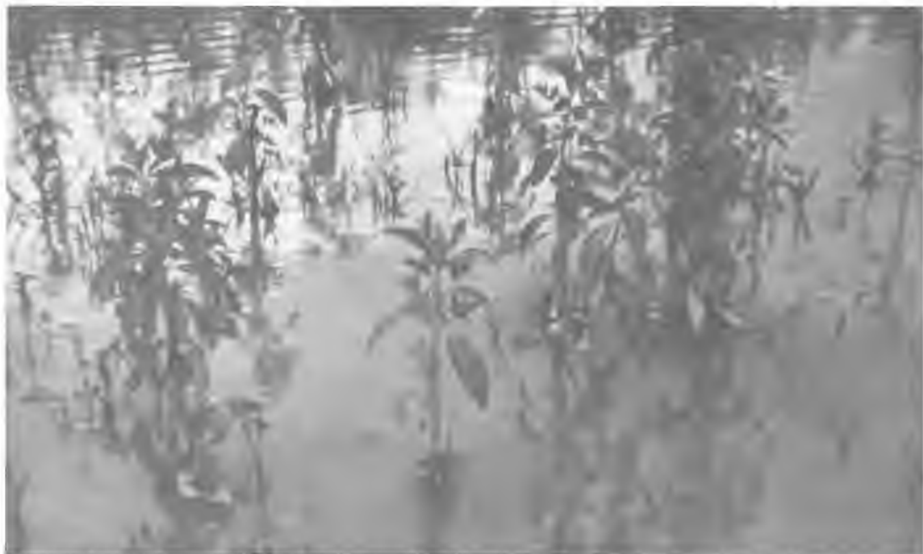
Sphenoclea zeylanica grows in the Amazon in areas subjected to three or four months of deep flooding. Isla de Ronda, Río Amazonas, Comisaría del Amazonas, Colombia.

produced any overt biological effects that could be construed as toxicity to animals.