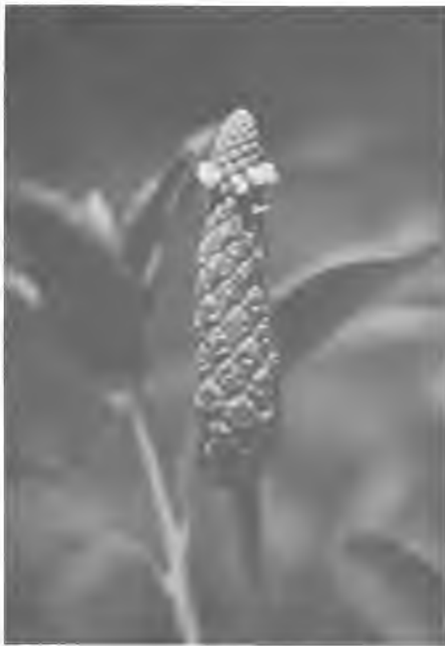
Inflorescence of Sphenoclea zeylanica, Leticia, Río Amazonas, Comisaría del Amazonas, Colombia.