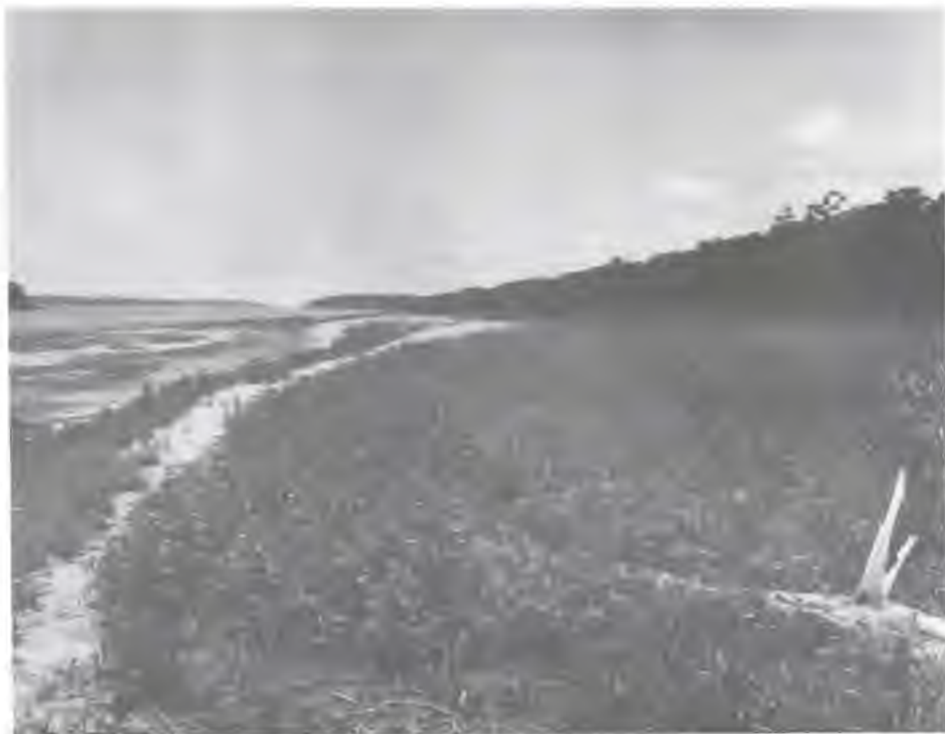
Sphenoclea zeylanica. Solid growth on bank of island at lowest water. Habitat from which Schultes, Raffauf et Soejarto 24046 was collected; Island 8 miles above Leticia, Río Amazonas, Colombia.