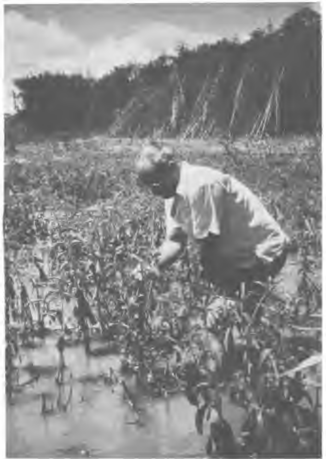
Dense stands of Sphenoclea zeylanica line the strands of the younger "islands" in the upper Amazon region. Isla de Ronda, Río Amazonas, Comisaría del Amazonas, Colombia.