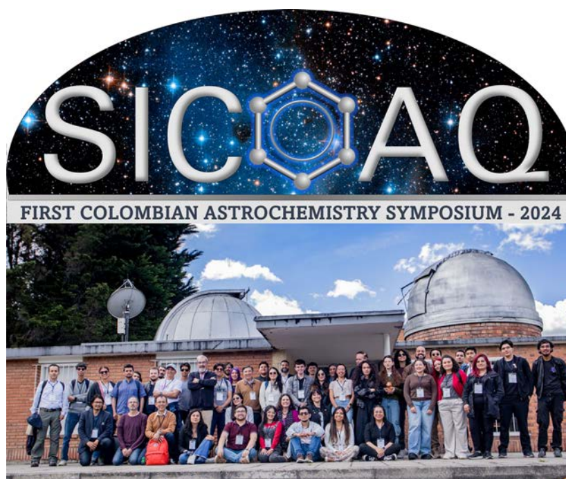
Figure 1. SICOAQ logo and official photograph taken in front of the Observatorio Astronómico Nacional de Colombia at Universidad Nacional de Colombia in Bogotá