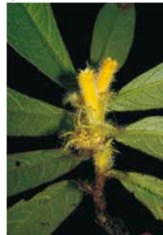
Figure 2. Columnea paraguensis A. Vegetative shoot with subsessile leaves disposed in close-set arrangement giving the plant a fern like appearance ( sensu Wiehler 1983). B. Inflorescence showing only one flower open at the time. The corolla shows the four external yellow appendages, a bilabiate limb, and a red external indument at the middle of the tube; basally a pale green fruit covered by a pale green, lacinate calyx is observed. C Columnea fuscihirta L. P. Kvist & L. E. Skog. Vegetative shoot dorsiventral with subsessile leaves in a close-set arrangement; flowers showing an architecture defined by the following traits limb tubular, yellow, subactinomorphic, absence of corolla appendages, and a pale green fimbriate calyx.