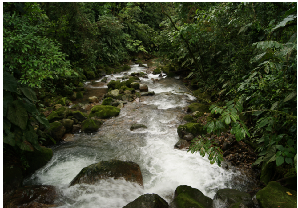
Figure 1. Channel stream in the Orotoy river where the organisms were collected